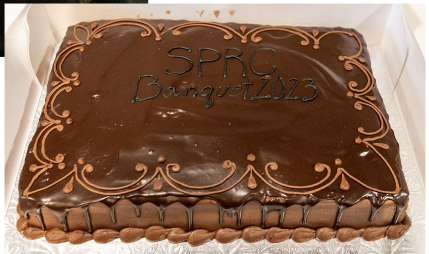
The sweet cake served for desert.