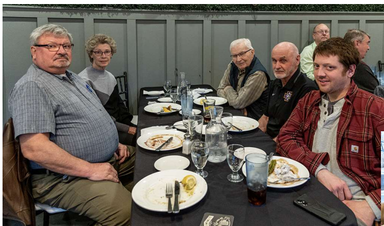
A few of the satisfied SPRC banquet attendees after enjoying a fine meal.