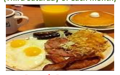
Denny's Restaurant 1664 University Ave. W. One block West of Snelling Ave. (Across from Ax Man)