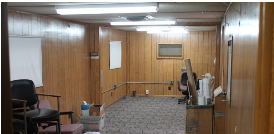
No longer a ham shack—just a shack