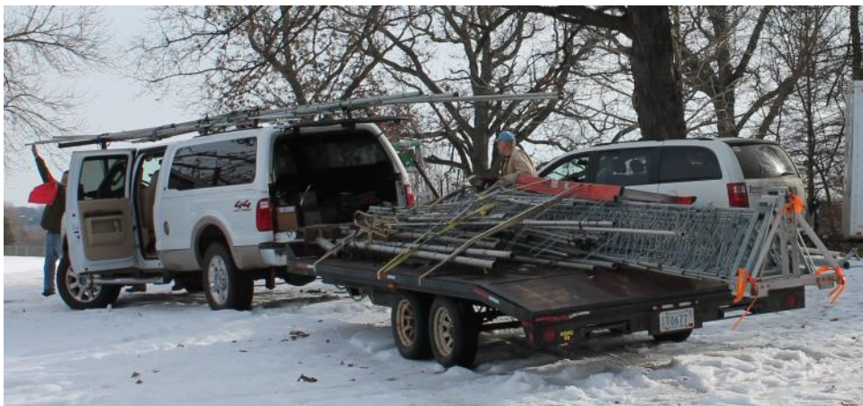
Used, but serviceable, antenna farm kit

www.tagme-engraving.com Click “Name Tags” then “St. Paul Radio”